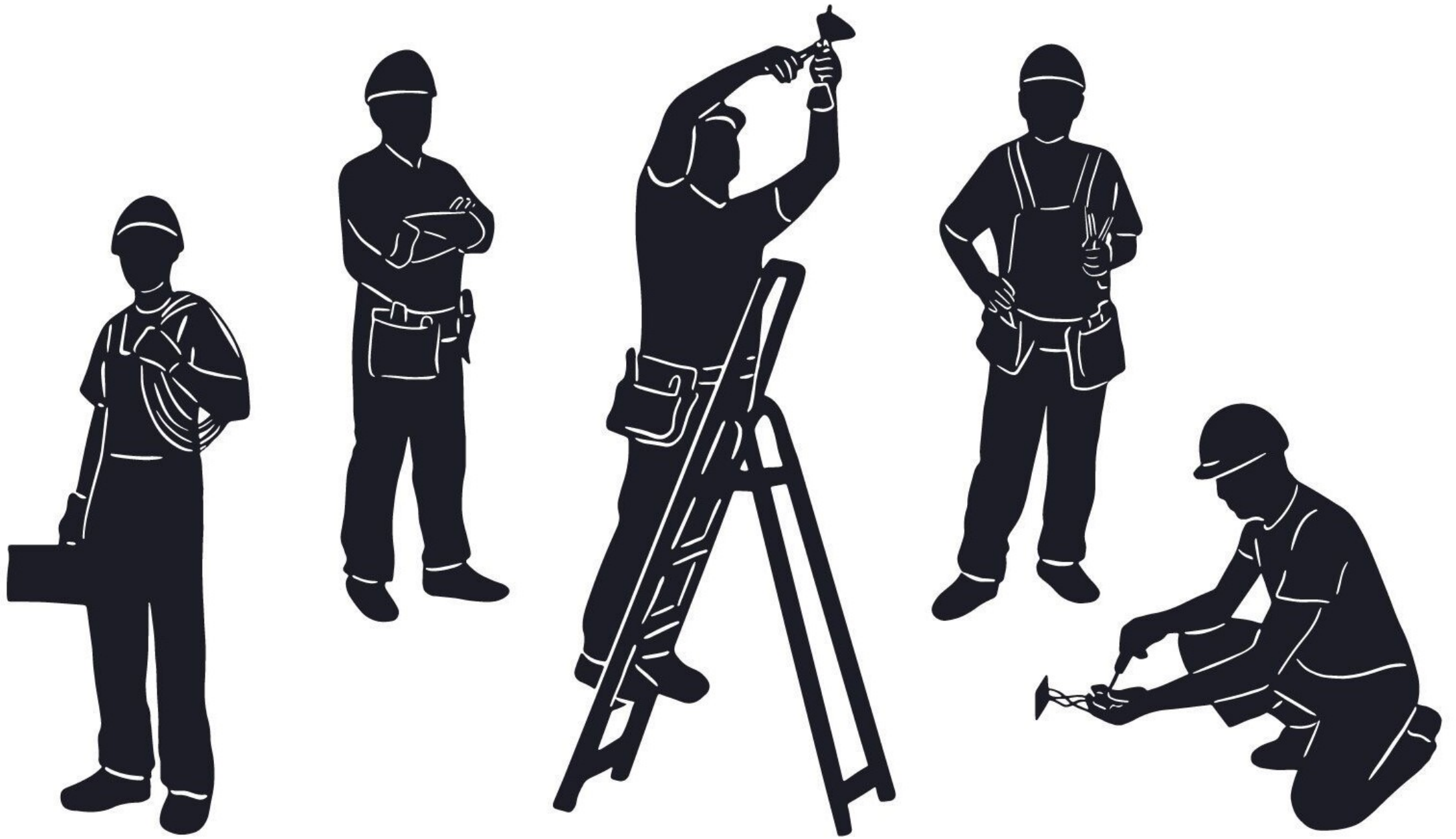
Sungai Way-Subang Methodist Church