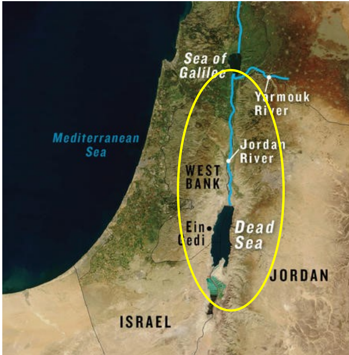
Sungai Way-Subang Methodist Church