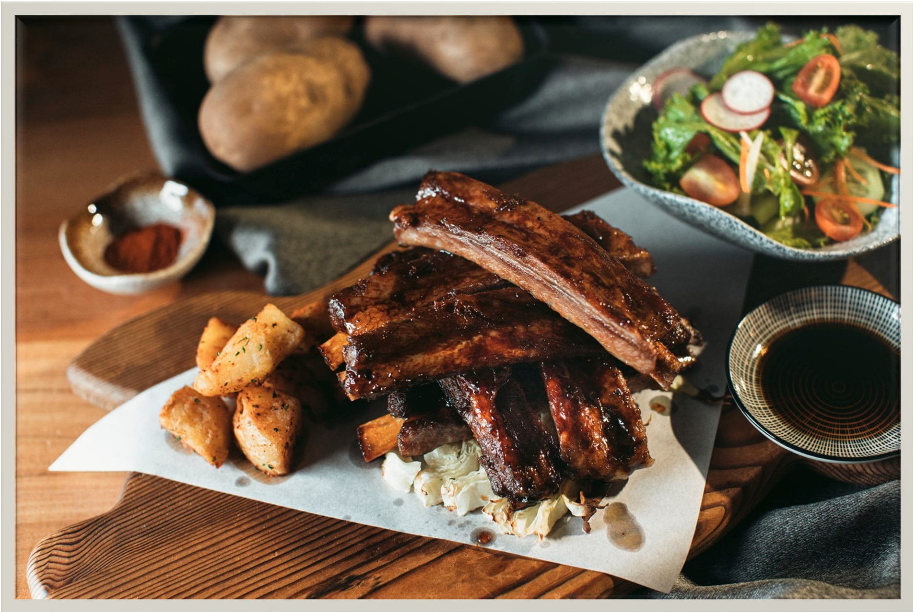
Sungai Way-Subang Methodist Church