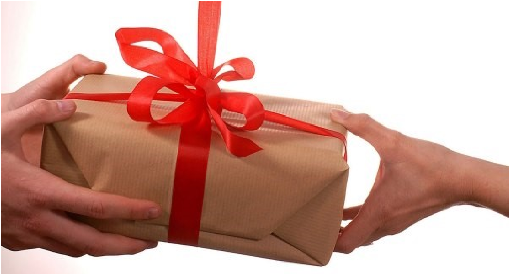
Sungai Way-Subang Methodist Church