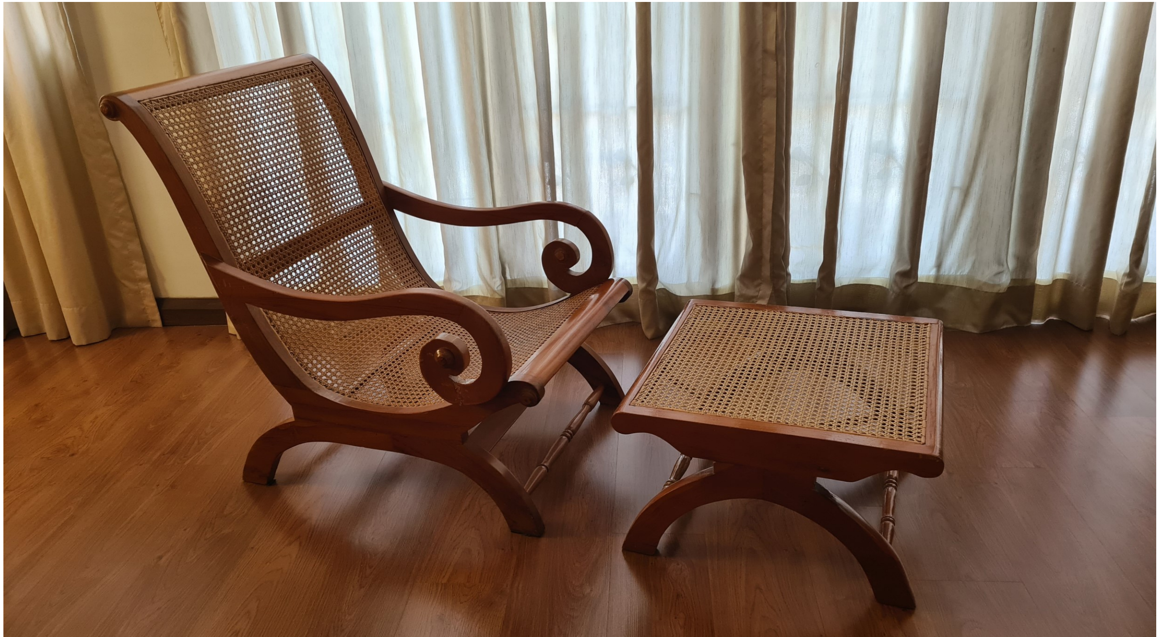
Sungai Way-Subang Methodist Church